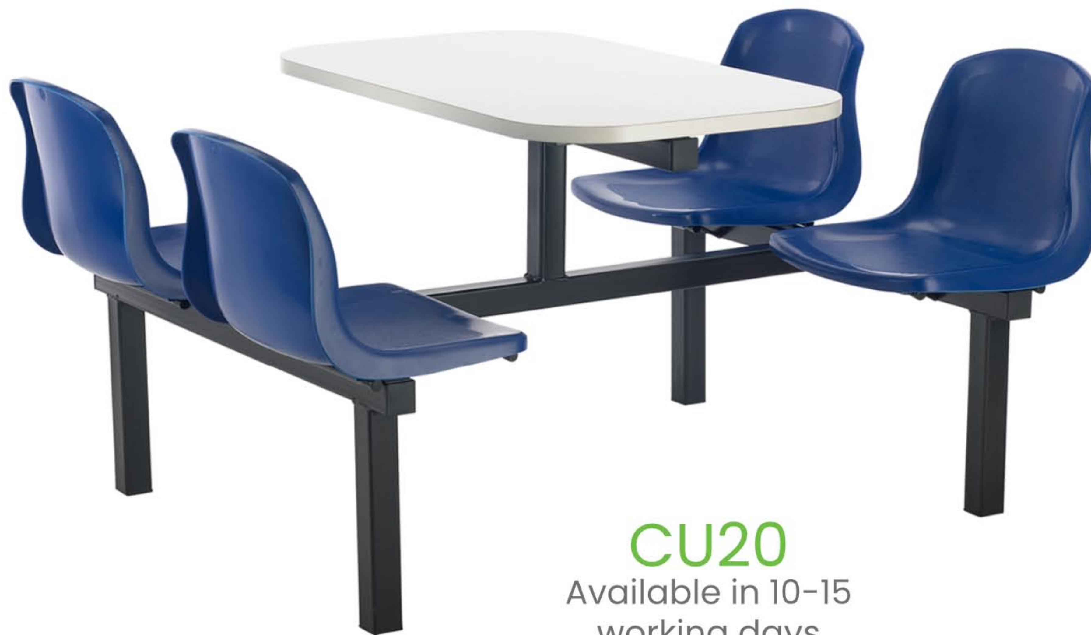
CU20 Available in 10-15 working days